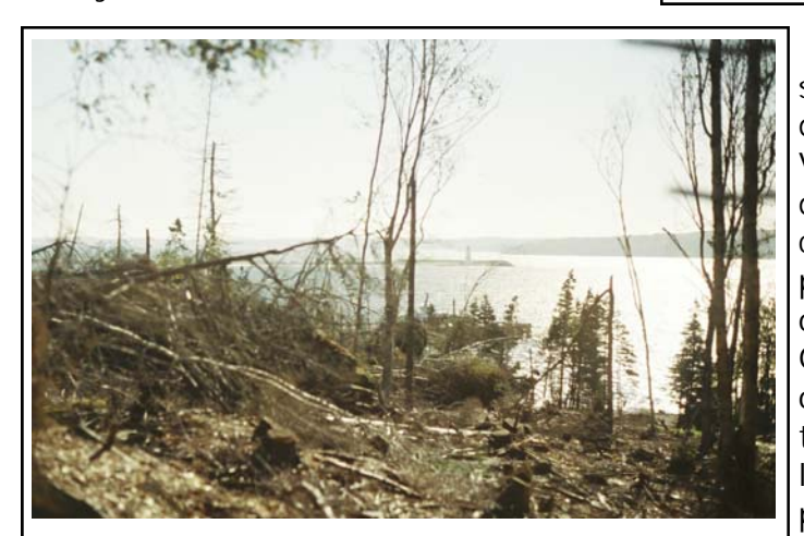
The lighthouse and harbour as viewed from Tea House Lane

saddened to see the extensive damage caused by Hurricane Juan. Visitors to the island couldn't understand why Natural Resources contractors did not upright and repair the convenient and well-used outhouse located at the foot of Garrison Pier. Rumor has it that one of the woodsman working on the island did upright the outhouse last spring, but was told by his superiors to tip it over again.