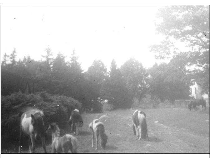
Ponies grazing on McNabs Island