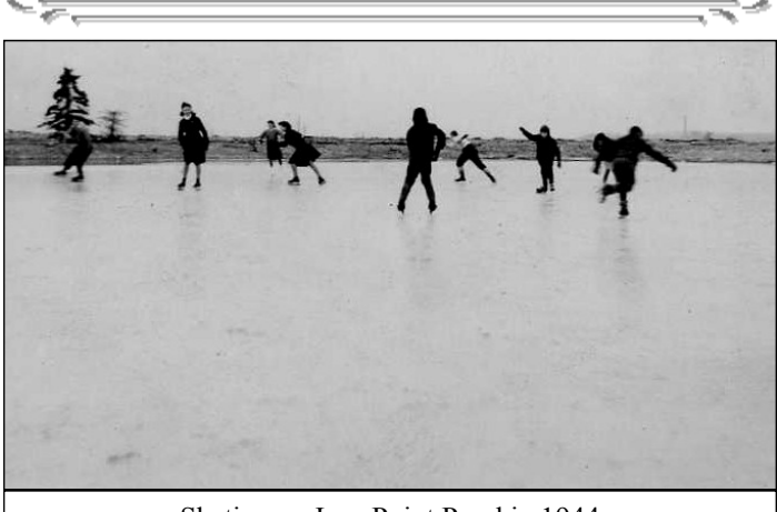
Skating on Ives Point Pond in 1944