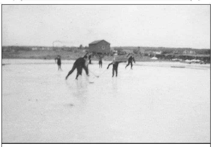
Pond hockey, Ives Point Pond in 1937